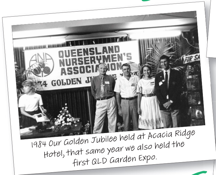
1984 Our Golden Jubilee held at Acacia Ridge Hotel, that same year we also held the first QLD Garden Expo.