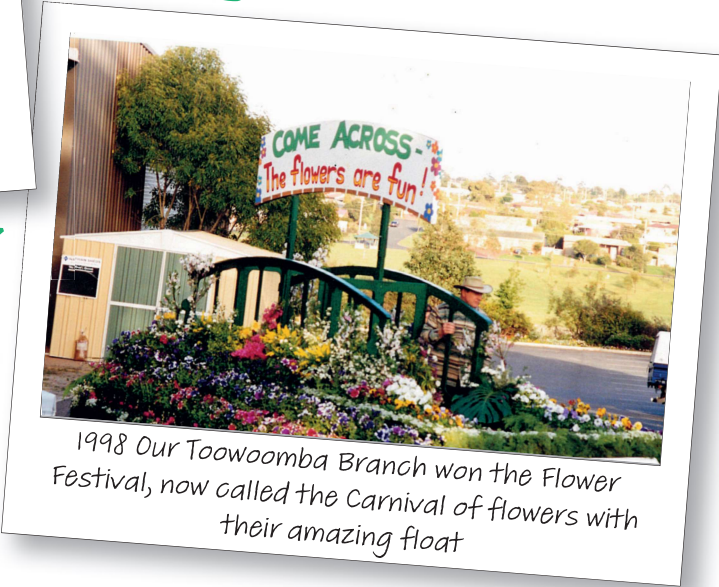
1998 Our Toowoomba Branch won the Flower Festival, now called the Carnival of flowers with their amazing float