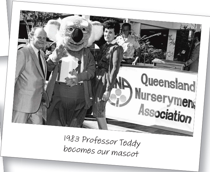
1983 Professor Teddy becomes our mascot