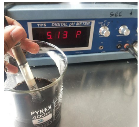
Growing media sample undergoing a pH test.

pH is a measure of the concentration of hydrogen ions in a solution. It is measured on a scale of 1-14, with the pH value of 7 considered neutral. Values less than 7 are acidic and values more than 7 are alkaline or basic. Each unit on the pH scale represents a change in concentration of hydrogen ions by a factor of 10. This means that it will take 10 times the amount of