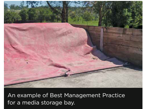
An example of Best Management Practice for a media storage bay.

Growers are advised to consult with their growing media manufacturer/