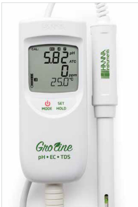
An example of a pH/EC meter used to test growing media.

Electrical Conductivity is a measure of the total concentration of electrically charged particles (ions) in a solution and indicates the amount of soluble salt in the growing media. All fertilisers applied in nursery production are salts and EC can be measured to give a broad indication of the nutritional status of a growing media.