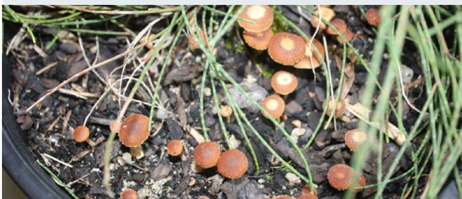
Mushrooms ( Deconica sp.) can be unsightly and reduce plant saleability.

This Nursery Paper will discuss how contaminant fungi enter the nursery environment, how to recognise them, and how they affect the properties of growing media. It will also provide guidelines on preventative measures to minimise the risk of contamination, as well as remedial actions to address infestations when they occur.