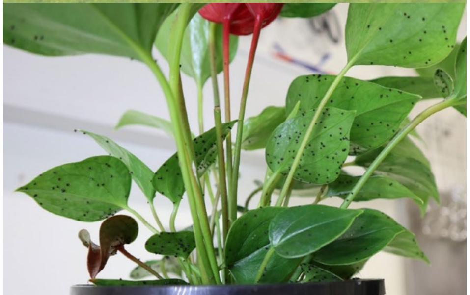
Sphaerobolus shotgun fungus fruiting bodies on Anthurium .