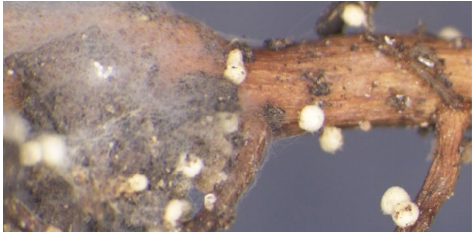
Fruiting bodies of a mushroom fungus (family Agaricaceae) growing thickly on the roots of Syzygium .

The most common and serious issue caused by superabundant fungal growth in growing media is irreversible hydrophobicity. This prevents even water distribution through the pot, leading to stunted plant growth. Some fungal species can also significantly lower the pH of the growing media.