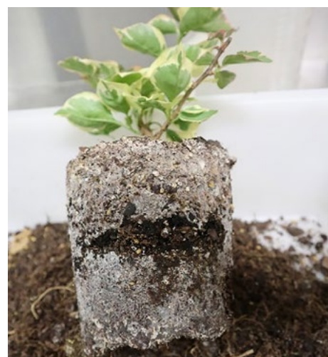
Bougainvillea infested with Leucocoprinus fungi causing the media to become hydrophobic.

Mushrooms and fungal fruiting bodies in the media are also considered contaminants. As well as being unsightly and potentially reducing saleability, some of these fungi can cause the growing media to become hydrophobic. Shotgun fungi can propel their fruiting bodies 2-6 metres, often landing on the lower leaves of plants. Although these fruiting bodies are epiphytic (that is, they grow on a plant only for physical support and do not harm the leaves), they can still be unappealing or be mistaken for fungal pathogens or scale insects.